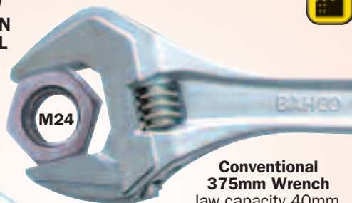
Conventional 375mm Wrench Jaw capacity 40mm.

UP TO 20% GREATER JAW CAPACITY THAN CONVENTIONAL ADJUSTABLE WRENCHES