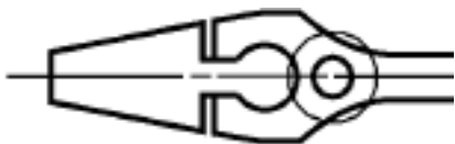
Tapered Jaw For Access Into Tight Spaces

Conforms to: BS 6333-1995, DIN3117-1988.