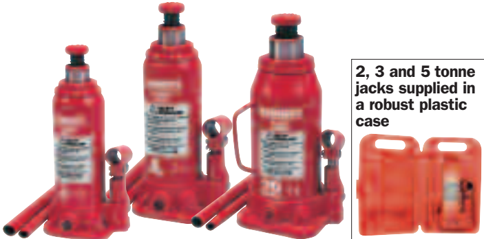
2, 3 and 5 tonne jacks supplied in a robust plastic case

With large cast iron bases with a steel cylinder housing and an adjusting notched saddle. Fitted with an overload protection valve. Two piece 'pumping' handle also operates hydraulic release. Use on a firm level surface. DO NOT work under the vehicle until another means of support, such as axle stands, are used. Models B234, B337 and B541 are supplied in a robust blow moulded carry case. Complies with the EC Machinery Directive. GS and TUV approved. (Load ratings are 'metric tonnes' i.e. 1 tonne = 1,000kg). All supplied with spare seals.